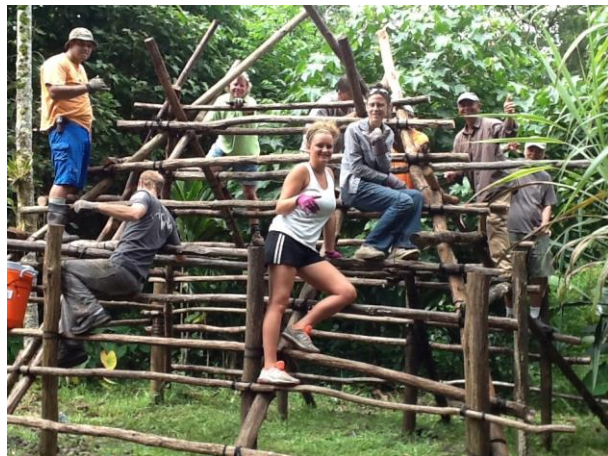
October 3 rd Hale Building Workshop volunteers.